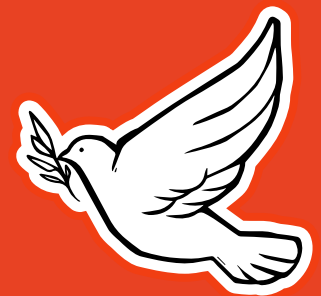
Dia de los Muertos Remembrance Honoring migrant fatalities at Texas border