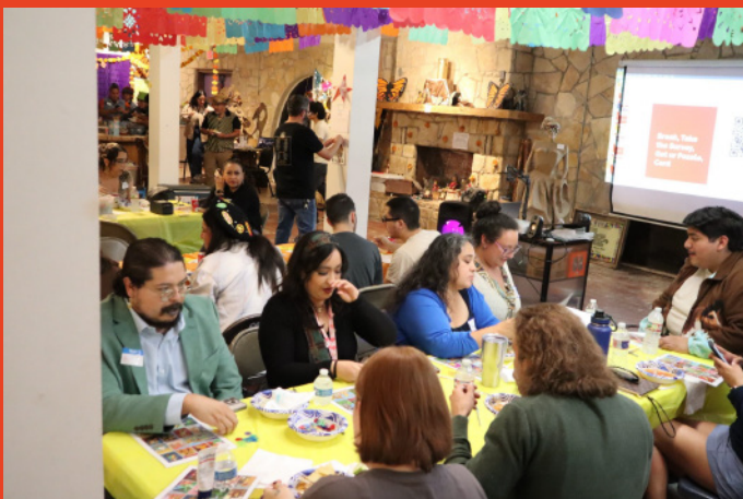
Civil Rights Night Series Inaugural Event Activating community members in Del Rio