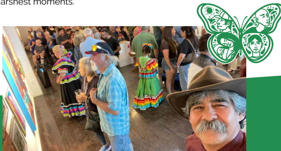
Border is Beautiful art exhibition celebrates resilience in Texas border communities

In 2024, TCRP litigators held Customs and Border Patrol liable for the wrongful death of a young man who died in custody due to negligence and lack of medical care. Four years after submitting the administrative complaint and continuing as co-counsel, TCRP finally received a settlement offer of $2.25 million on behalf of the family. This settlement sets an incredible precedent for holding state and federal agencies accountable for inhumane treatment, but it does not bring back a life. TCRP's legal work in our Beyond Borders program fights to dismantle the policies and processes that permitted the cruelty experienced by this young man and countless others coming into contact with our broken immigration system.