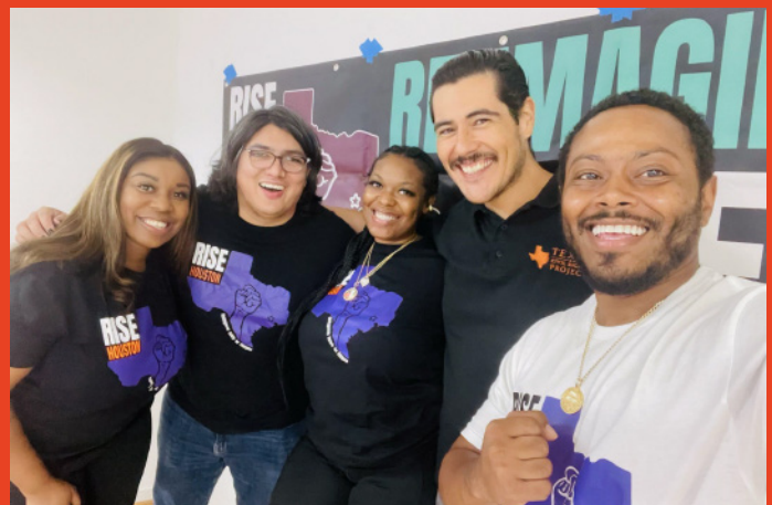
Launch of collaboration with Reimagining Safety for Everyone (RISE) Campaigning to stop police violence in Houston