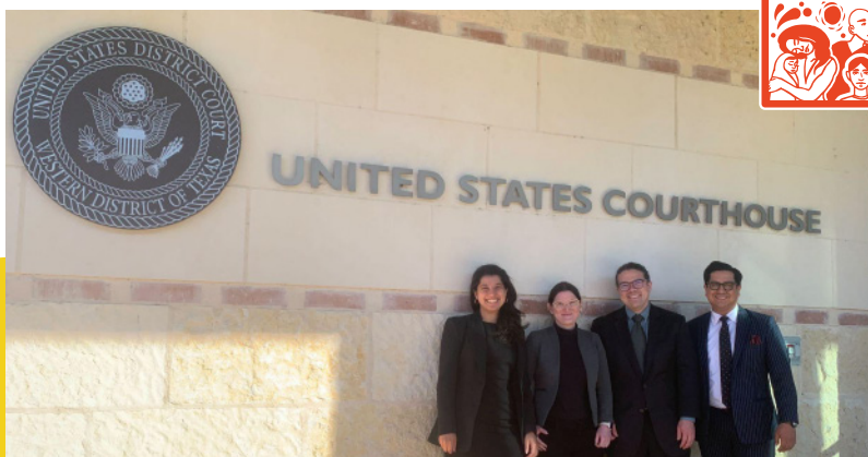
Voting Rights attorneys win positive rulings against SB1 voter restrictions