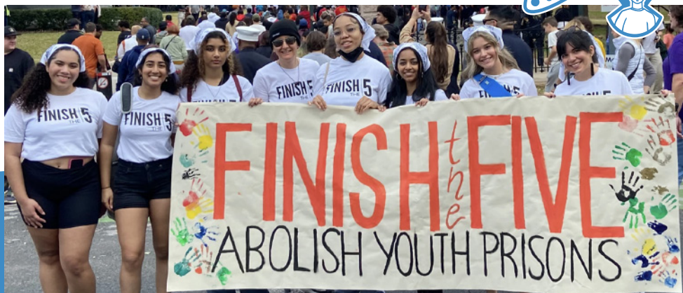
Finish the 5 youth leaders advocate for juvenile justice at the State Capitol